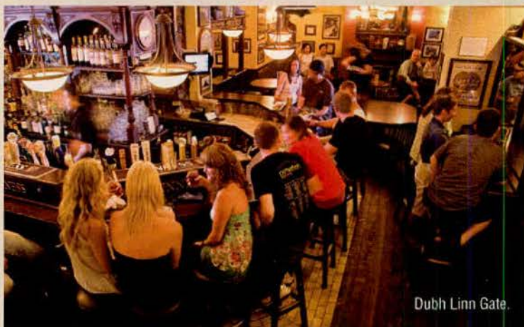
Dubh Linn Gate.

rent skates for $5) on the outdoor rink at Olympic Plaza, where you can keep warm outside with gas fireplaces and hot chocolate from a nearby café and the brew pub is a minute's walk away.