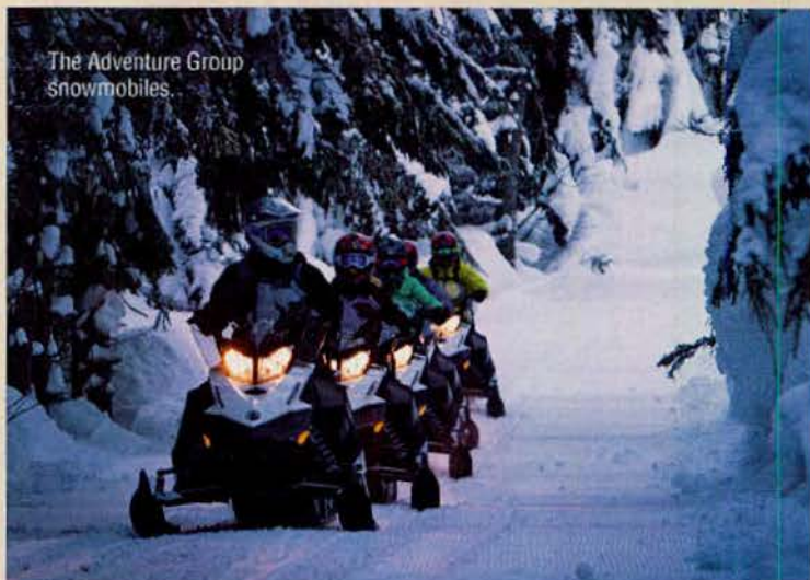
The Adventure Group snowmobiles.